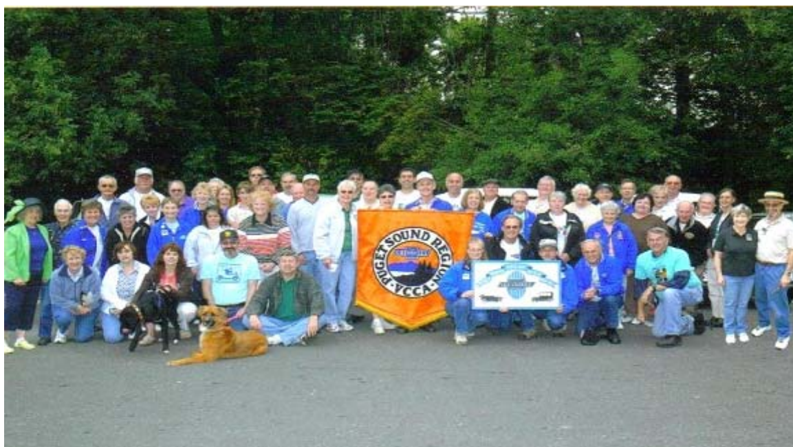
2007 Puget Sound Region Members at Wapato Park in Tacoma where first gathering of the Region was held in 40 years ago in 1967