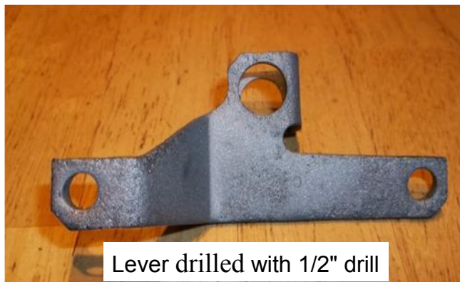
Lever drilled with 1/2" drill