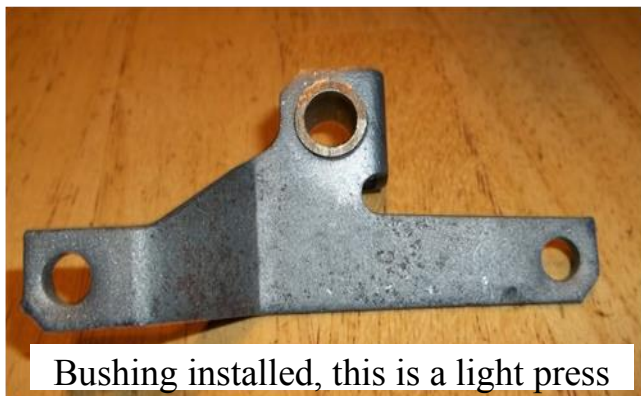
Bushing installed, this is a light press