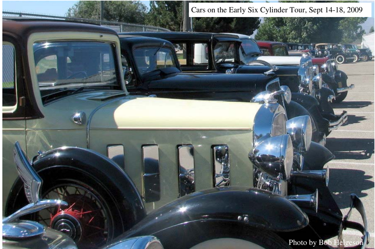
Cars on the Early Six Cylinder Tour, Sept 14-18, 2009