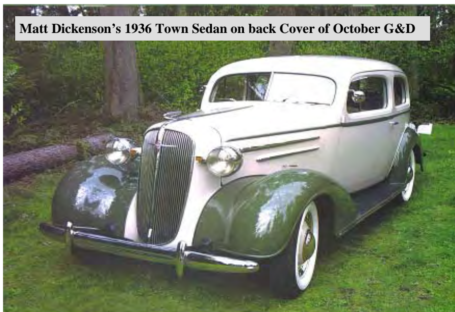
Matt Dickenson's 1936 Town Sedan on back Cover of October G&D