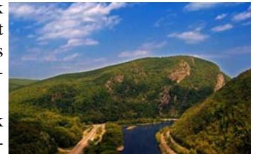
The Delaware Water Gap

Let's rewind - I started my day in mid-town Manhattan, NY, walked to the subway, took a train to Dover, NJ, and drove in a Chevy from Blairstown, NJ, and ended up in Mount Bethel, PA. I adore Chevrolet!!