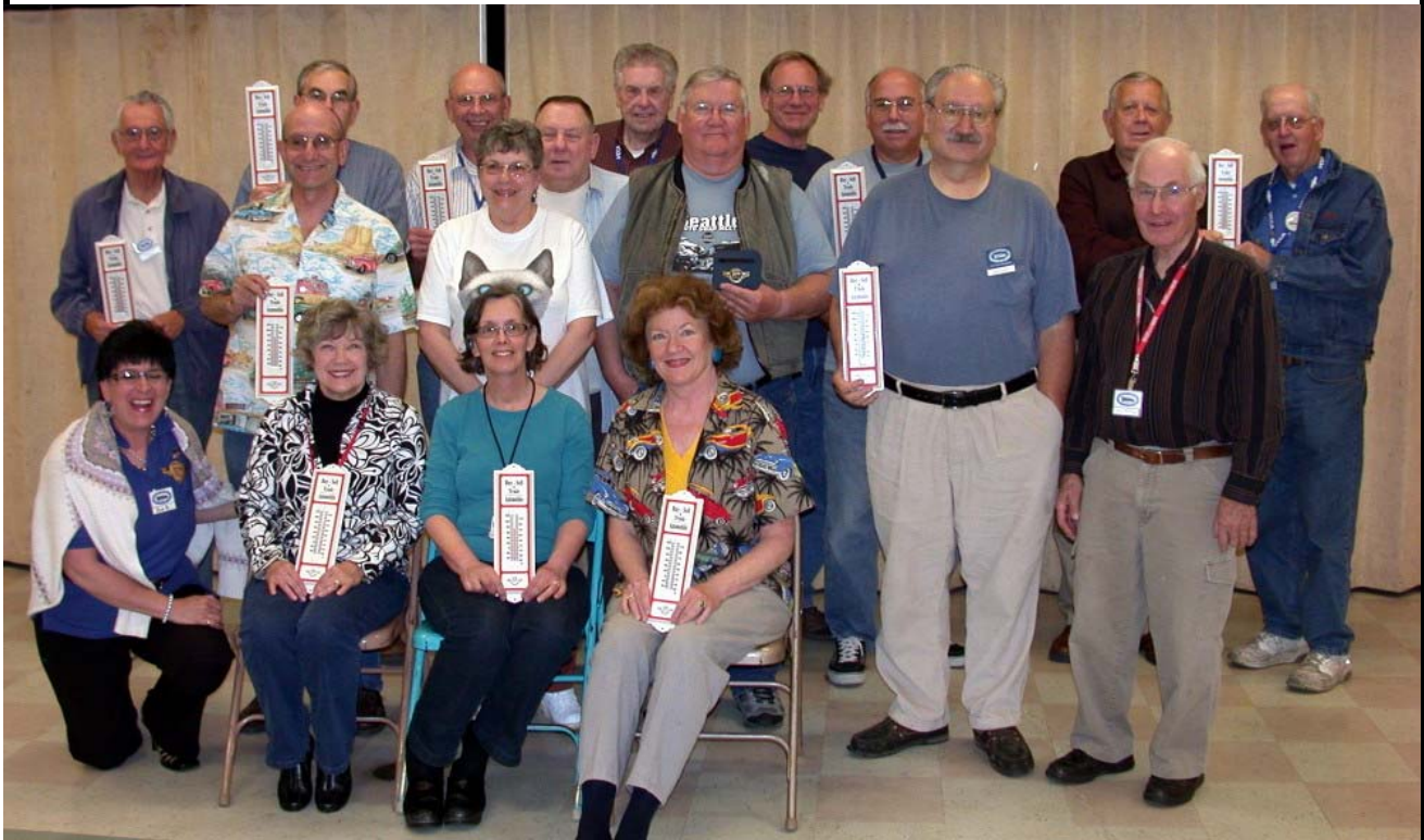
Monroe Swap Meet workers who were at the membership meeting on May 24th gathered for a group picture. They are holding the souvenir thermometers that each worker received. See the article on page 9 for more about the swap meet.