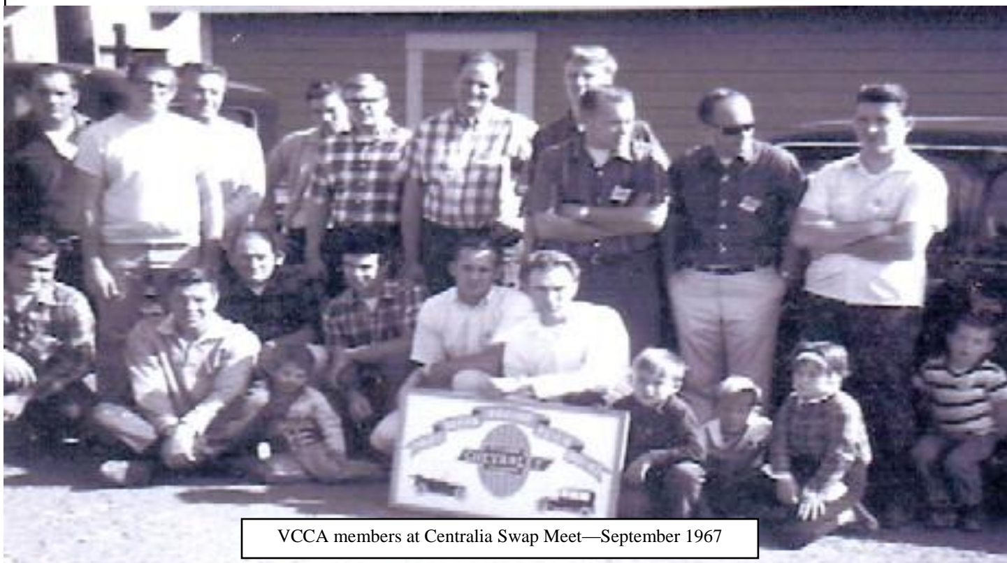
VCCA members at Centralia Swap Meet—September 1967