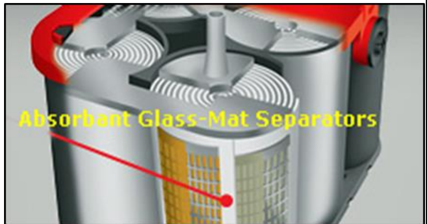
Figure 3. Optima AGM Technology

These batteries are still the same Lead/Acid technology as our old standby types, with a different twist. Instead of liquid electrolyte, they use a gel that is absorbed in glass mat separators between the cells as shown in Figure 3.