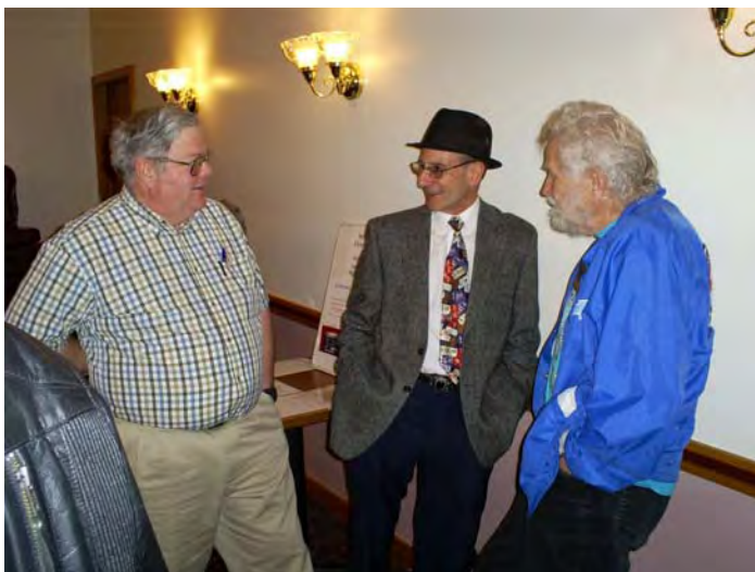
At the 2008 banquet, before dinner. Time to share a story or two. (See another 2008 banquet picture on the back page.)

If you do get stuck, Please stay alert, Watch the car behind you, So you don't get hurt.