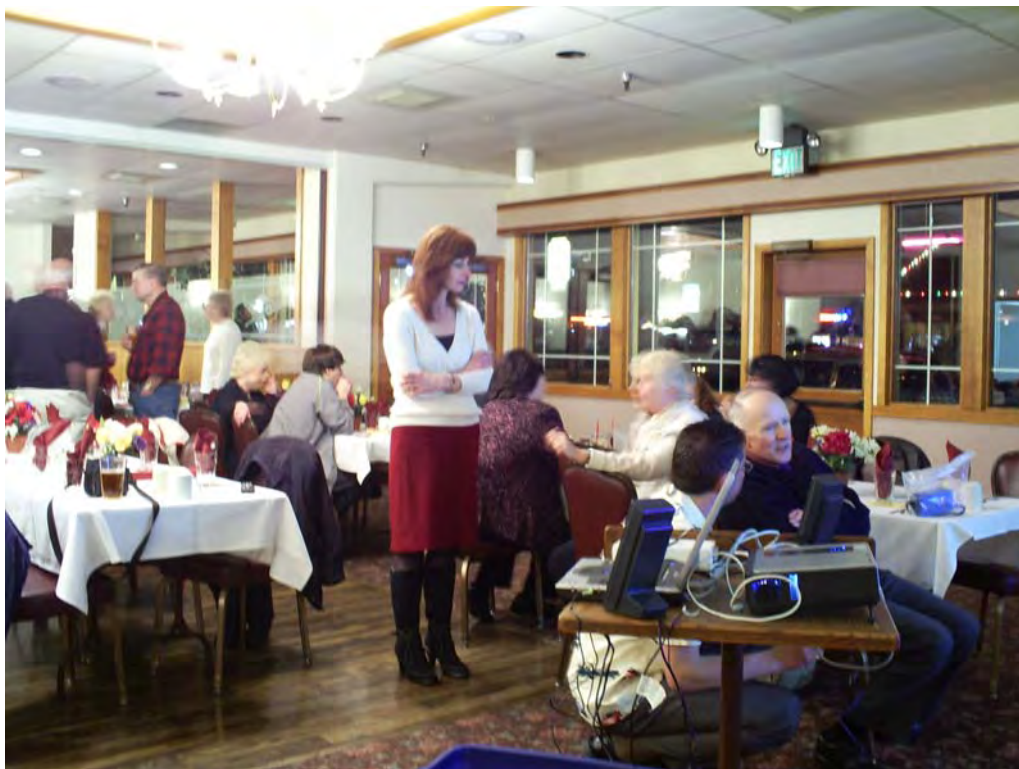
2008 PSVCCA Banquet