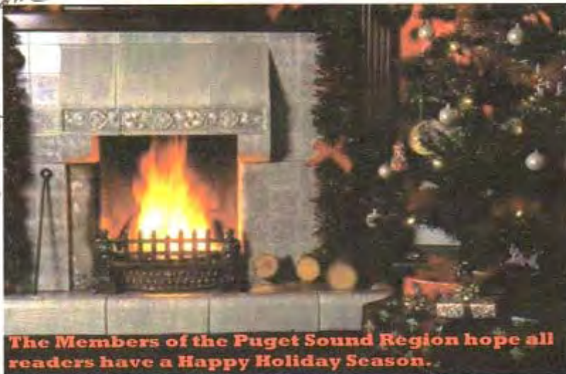
6 TAPPET CLATTER