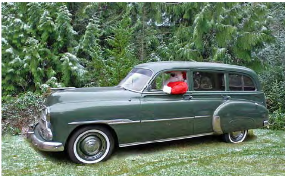
Comstock's new '51 Station Wagon on their front lawn with Santa greeting PS-VCCA members attending Christmas Party