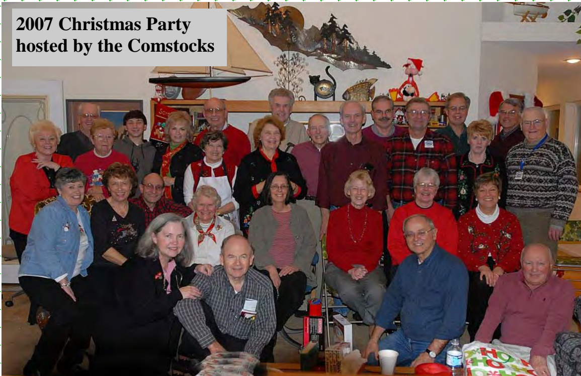
2007 Christmas Party hosted by the Comstocks