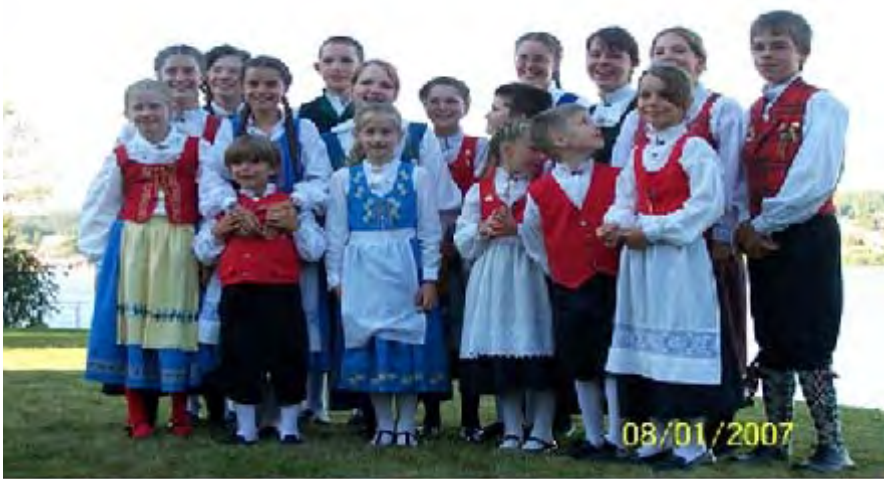
WOOD TOUR DANCERS