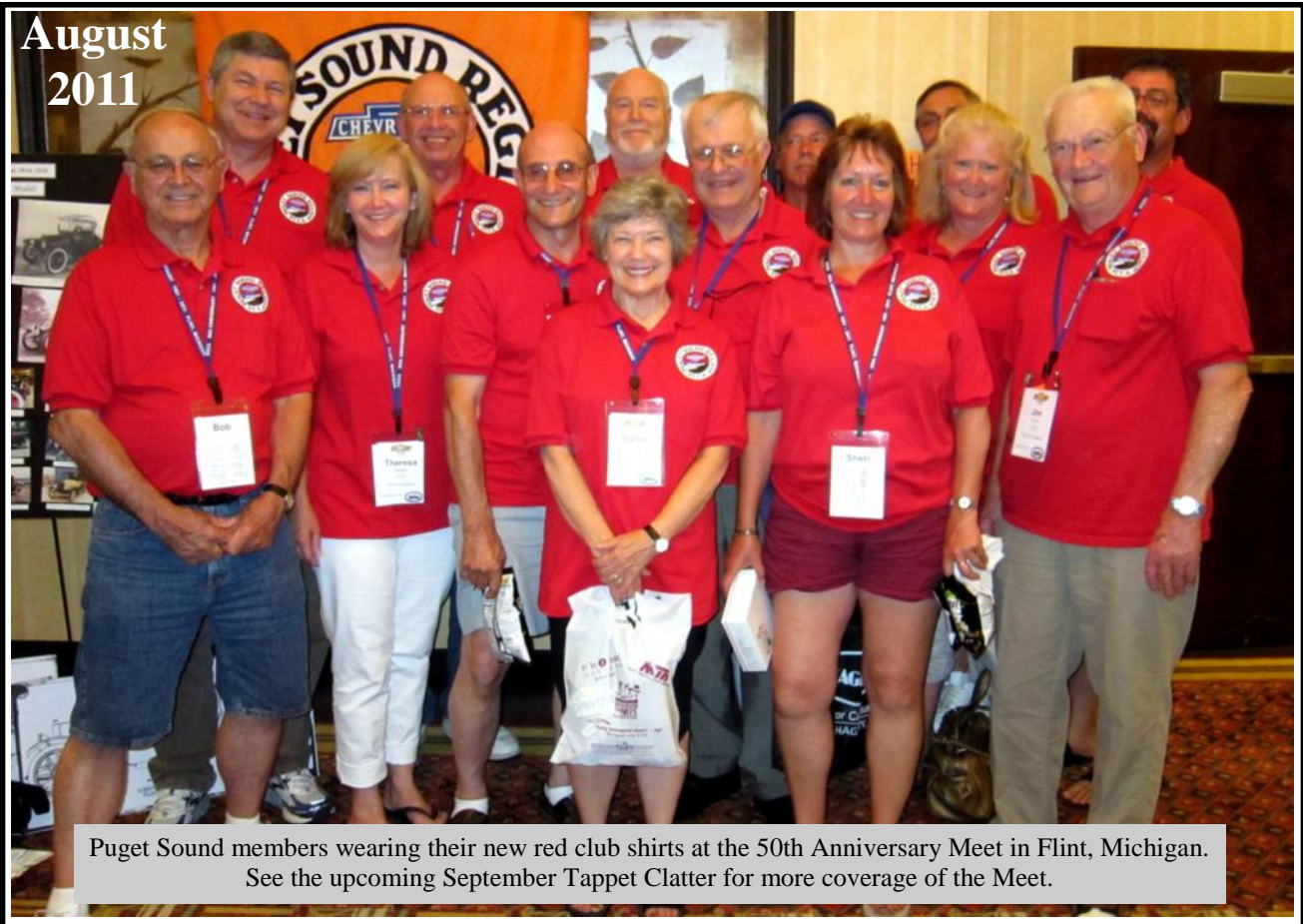
Puget Sound members wearing their new red club shirts at the 50th Anniversary Meet in Flint, Michigan. See the upcoming September Tappet Clatter for more coverage of the Meet.