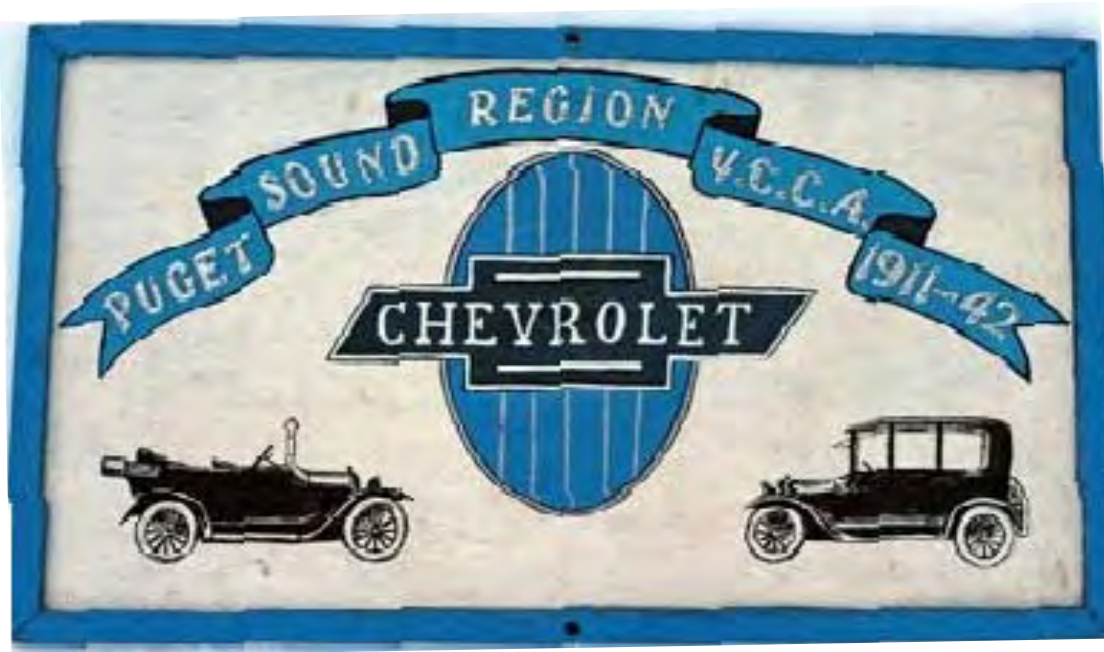
Puget Sound Region's first Club Sign.

Will be used on tour for photo of group in 2007.