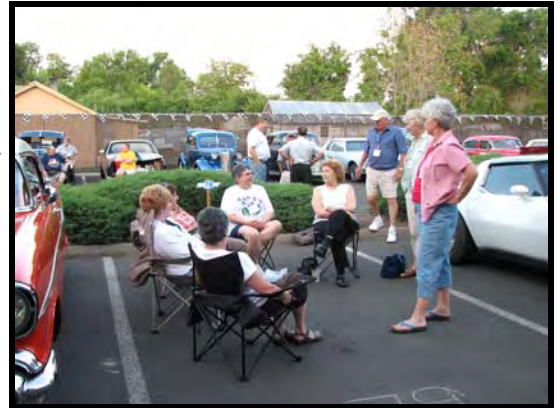
Puget Sound Ladies gathered in the the Parking area at NW Meet