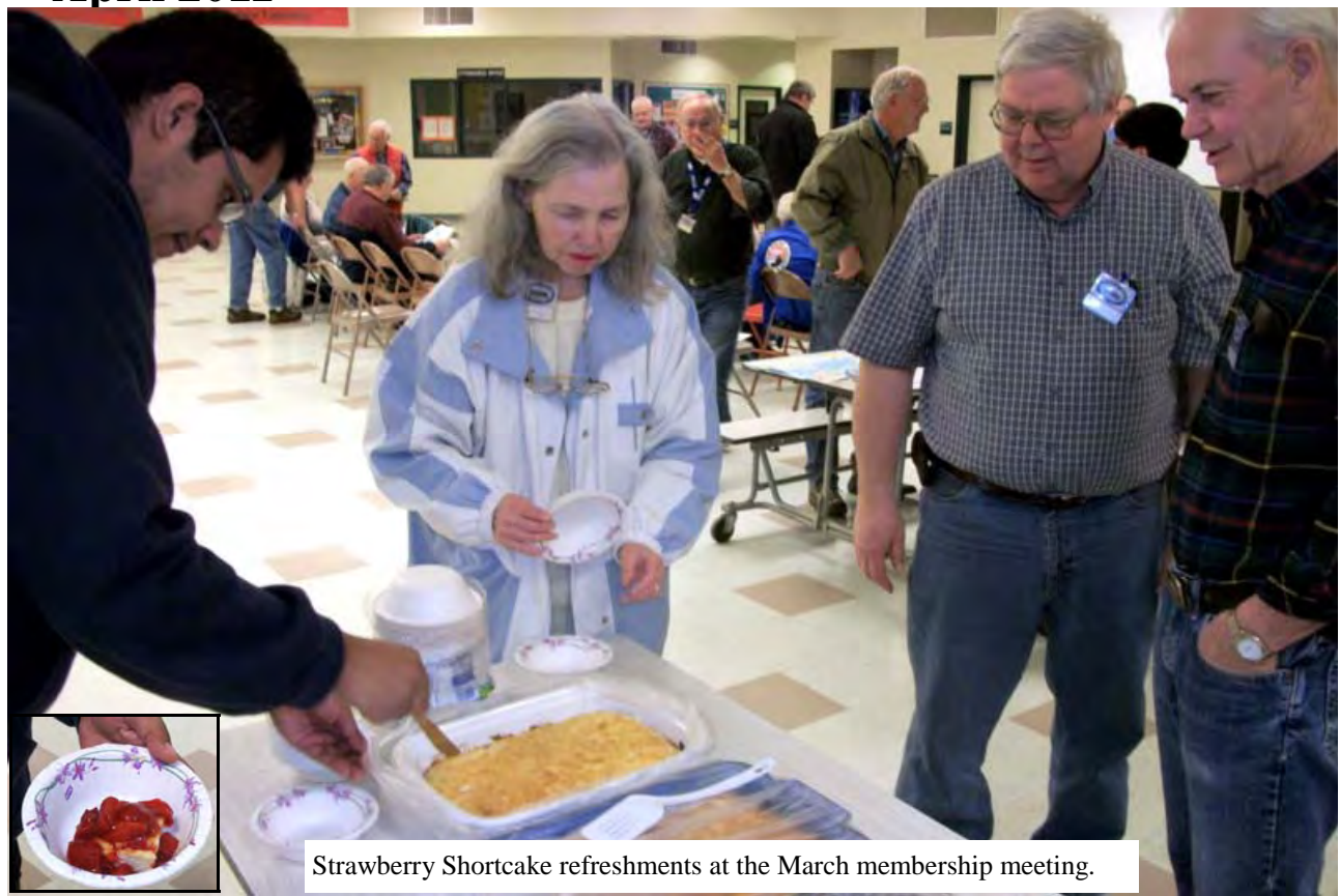
Strawberry Shortcake refreshments at the March membership meeting.