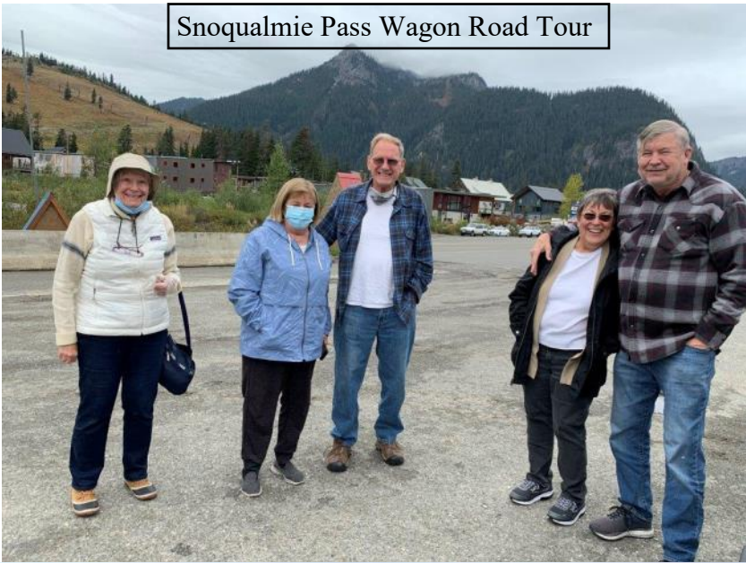
Snoqualmie Pass Wagon Road Tour