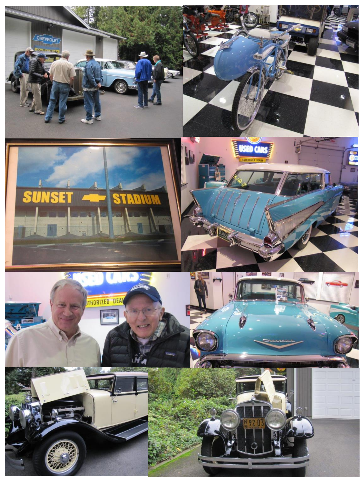
Tappet Clatter 4 October 2018