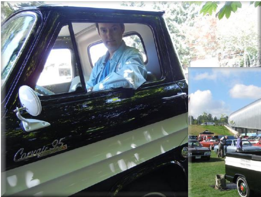
I was honored to be chosen to transport the Grand Marshals for the 75th annual Derby Days parade in Redmond, Washington, on July 11, 2015.