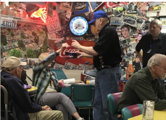
Meeting adjourned at 12:45 PM.