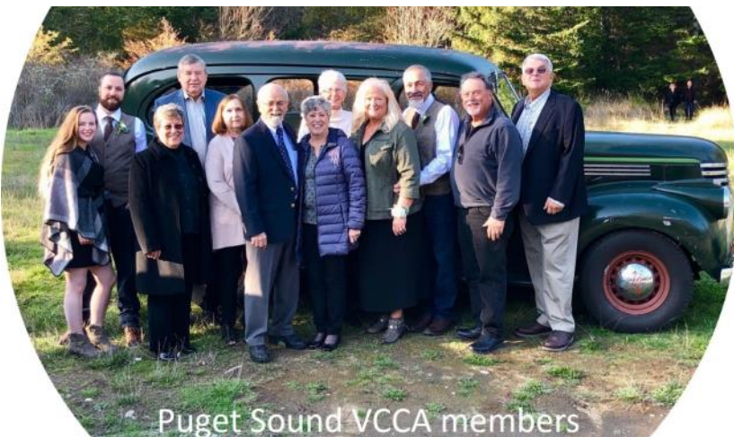
Puget Sound VCCA members