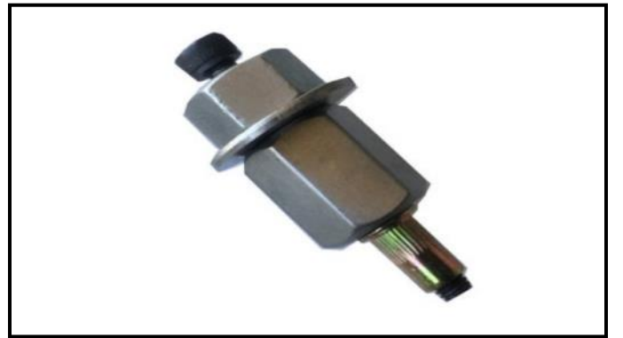
Inexpensive RevNut Tool