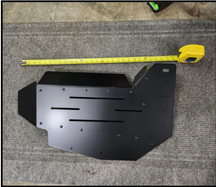
Guard 28" x 15"