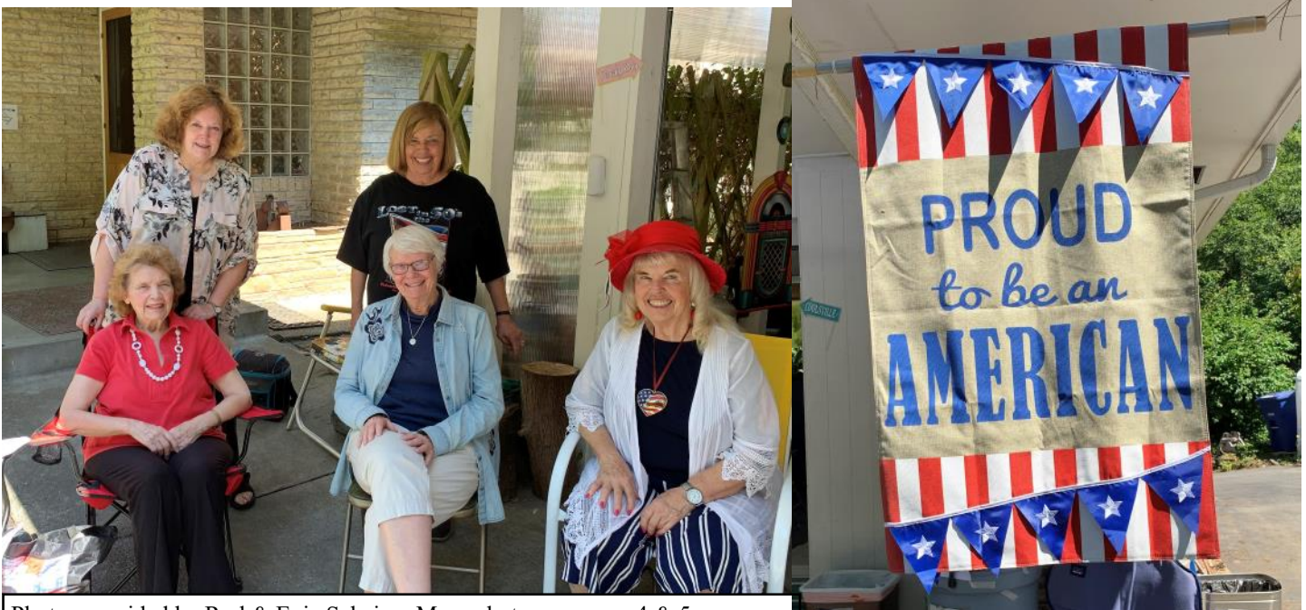
More photos on pages 4 & 5