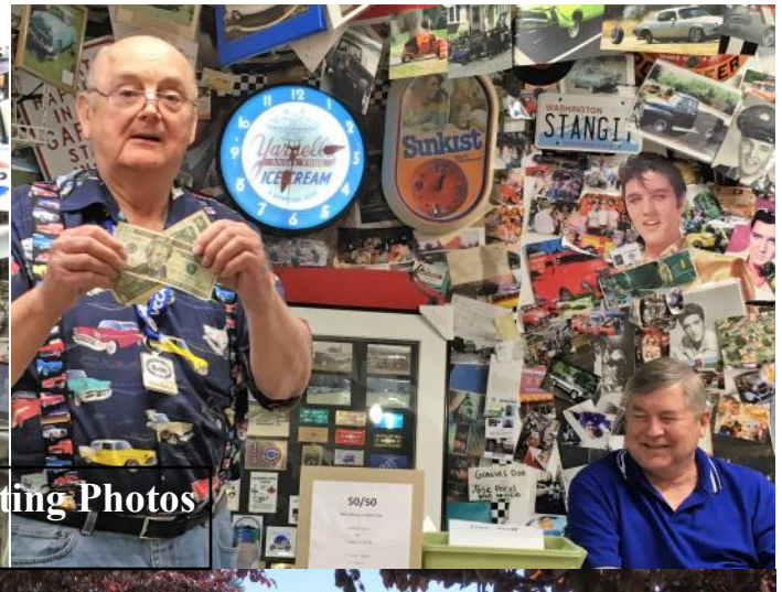
July Meeting Photos