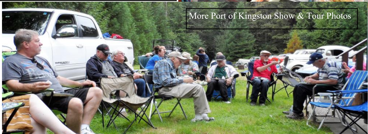
More Port of Kingston Show & Tour Photos